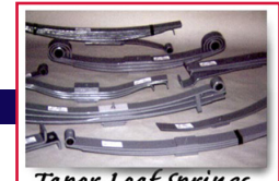
Taper Leaf Springs