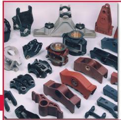
Cast & Stamped Hangers & Equalizers