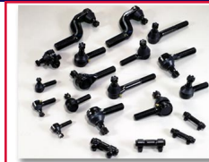
Tie Rod Ends

4275 Northpark Drive Colorado Springs, CO 80907 719-260-7992