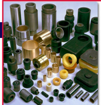
Bushings & Pads